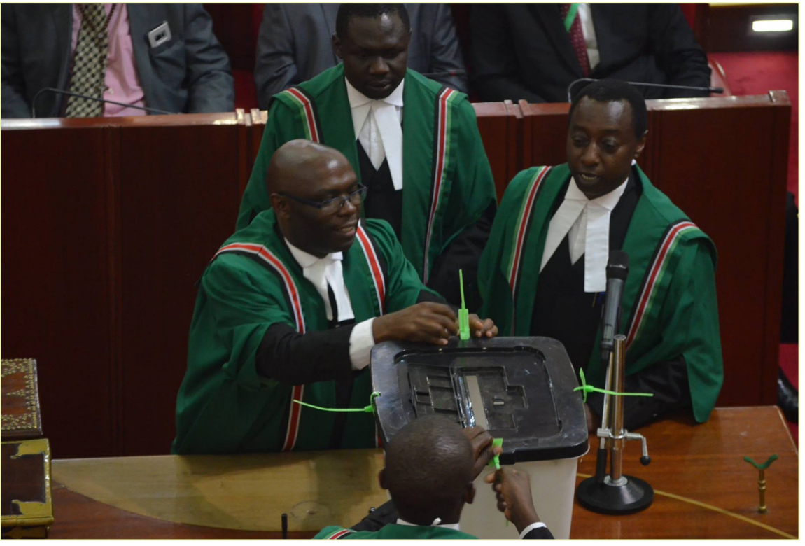
Securing the Vote during Election of the Speaker, 12th Parliament

The memorandum should generally indicate the objectives of the Bill. Upon receiving instructions from a Member or a Committee, the Speaker refers the legislative proposal to the Clerk, who employs the diverse legislative expertise of his office to formally engage the proposer and draft the proposal in the standard form of a Bill in terms of format and style and submit comments to the Speaker on-