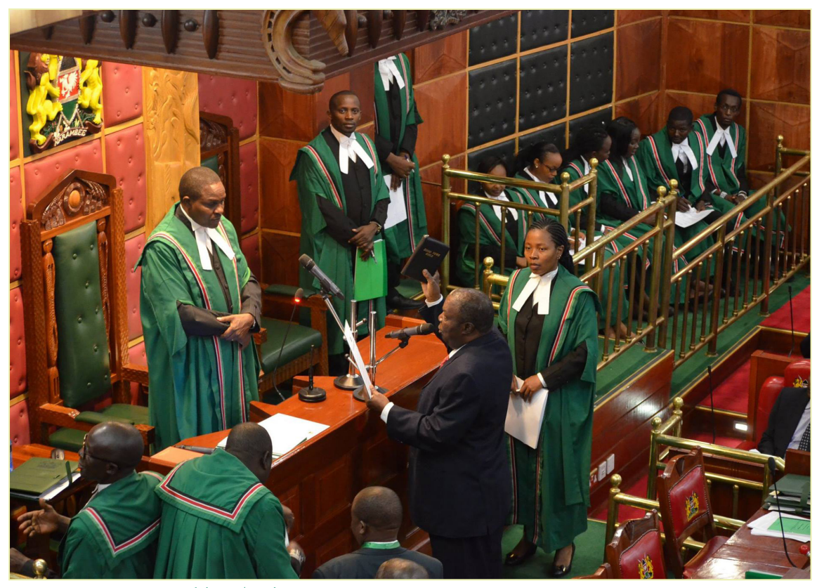
Swearing in ceremony of the 12th Parliament